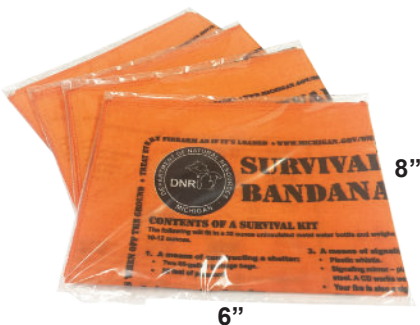
Standard Individual Fold & Poly Bag