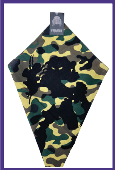
J HOOK with Customer Supplied Hang Tags