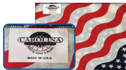
Edge sewn in label.