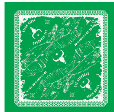
Border #73 (NEW)

Check out our website for more border options