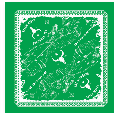
Border #73 (NEW)

Check out our website for more border options