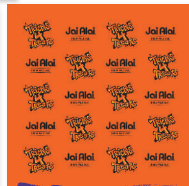
Engineered Random Logos

Don't see what you need? Our ART Team can create a custom designed bandanna for your brand, with supplied vector created art.