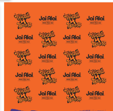
Engineered Random Logos

Don't see what you need? Our ART Team can create a custom designed bandanna for your brand, with supplied vector created art.