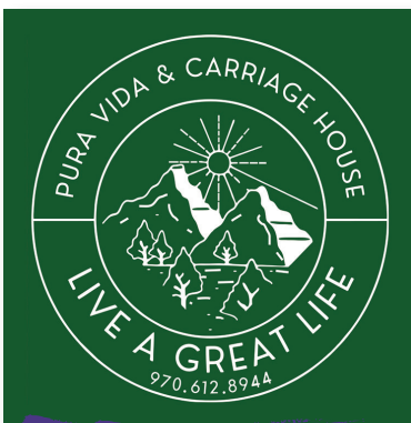
Large Central Logo